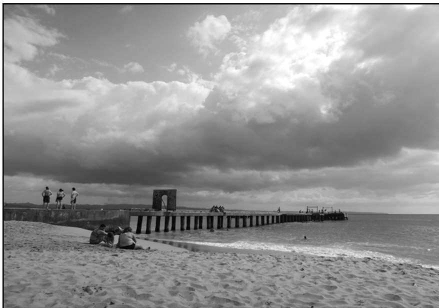
Crash Boat Beach

Crash Boat Beach, Aguadilla: From our apartment complex, you can see a jetty strutting out into a vibrant blue piece of the Atlantic. This is Crash Boat Beach. Upon arrival you’re greeted by the aroma of barbecued chicken and fried tostones. Small caravans are lined up on the perimeter of the beach selling everything from children’s beach floaties to piña colodas. As you walk through a scattering of picnic benches and palm trees, you reach the clear sand and soft waves. Locals sit sprinkled on the warm sand and in the blue-green ocean. It’s a small beach, not at all crowded, yet filled with enough people to be merry. It’s one of the calmest beaches I’ve been to and we spent many a day in our week-long trip sitting under cover of an umbrella on Crash Boat Beach. We swam, we baked, and we watched people brave the jump off the old pier into the ocean. I even ventured that jump myself,